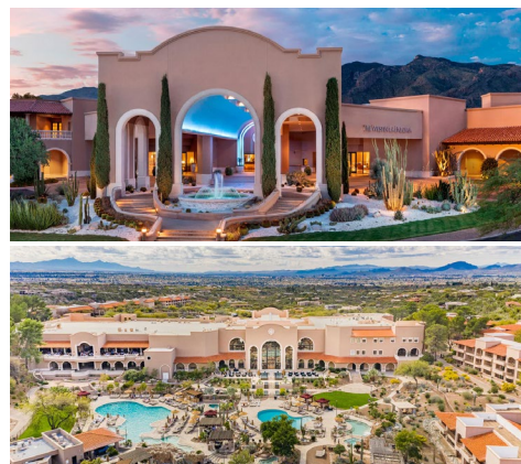
The Westin La Paloma Resort & Spa

Sponsorships are limited to the first 18 companies!